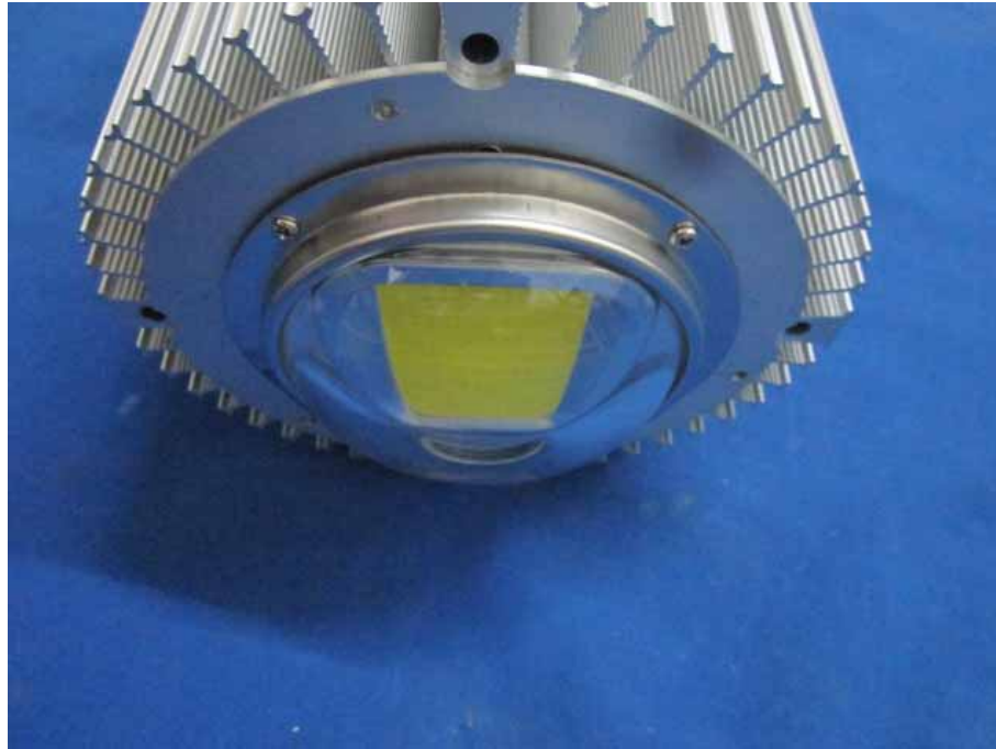
Photo 2 General Appearance of the EUT